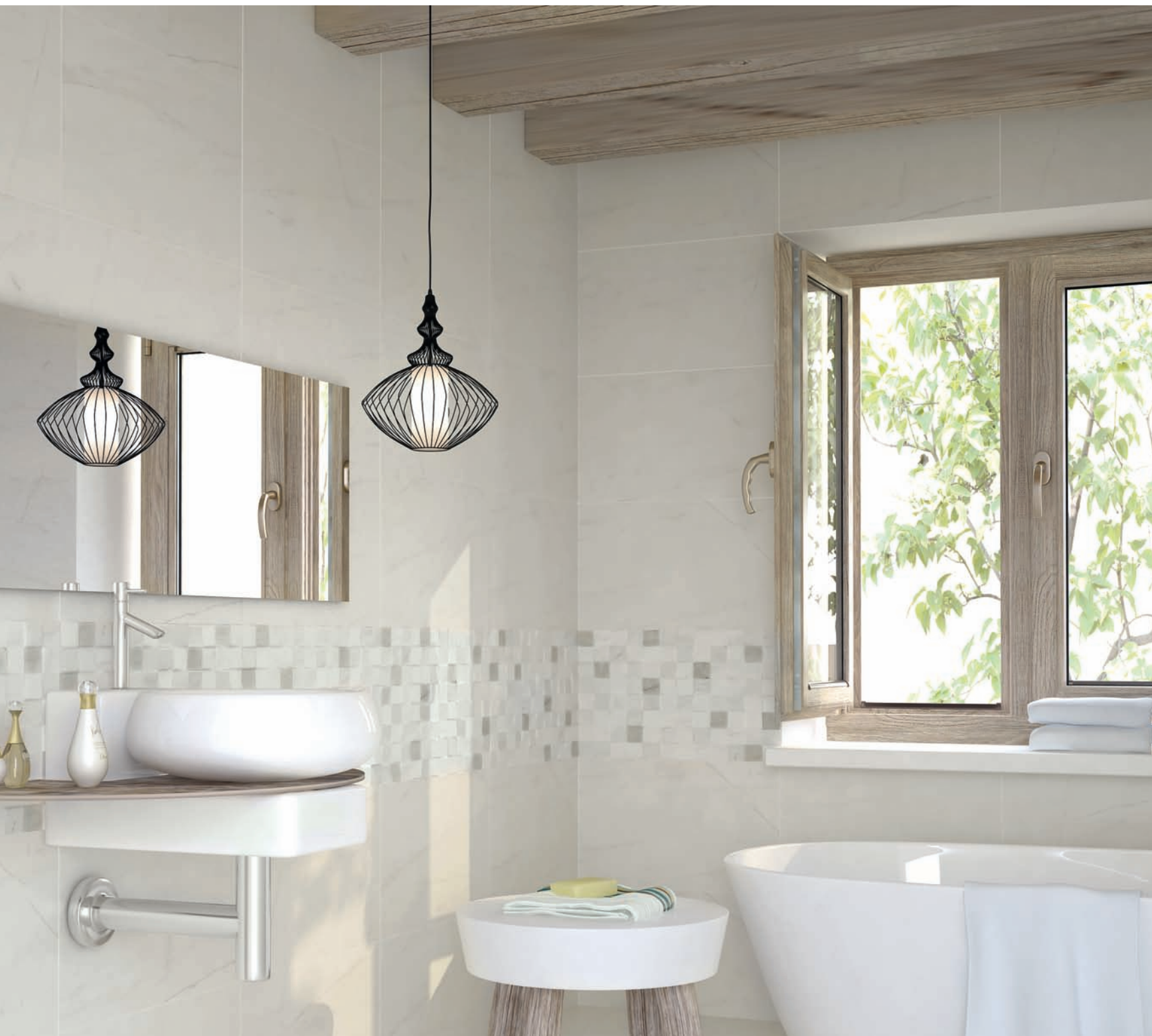
Rvto. / Wall / Rvtm.: At. Chipre Blanco 33,3x55 - At. Rlv. Chipre 33,3x55