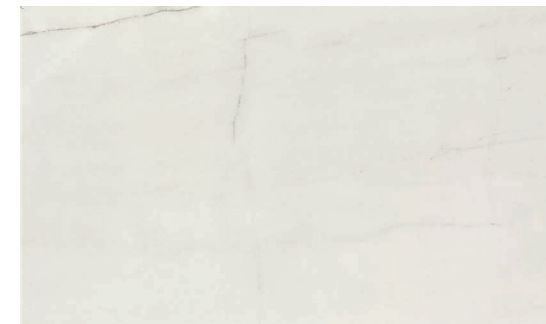
●At.Chipre Blanco 33,3x55 M07 2.870.12.4069