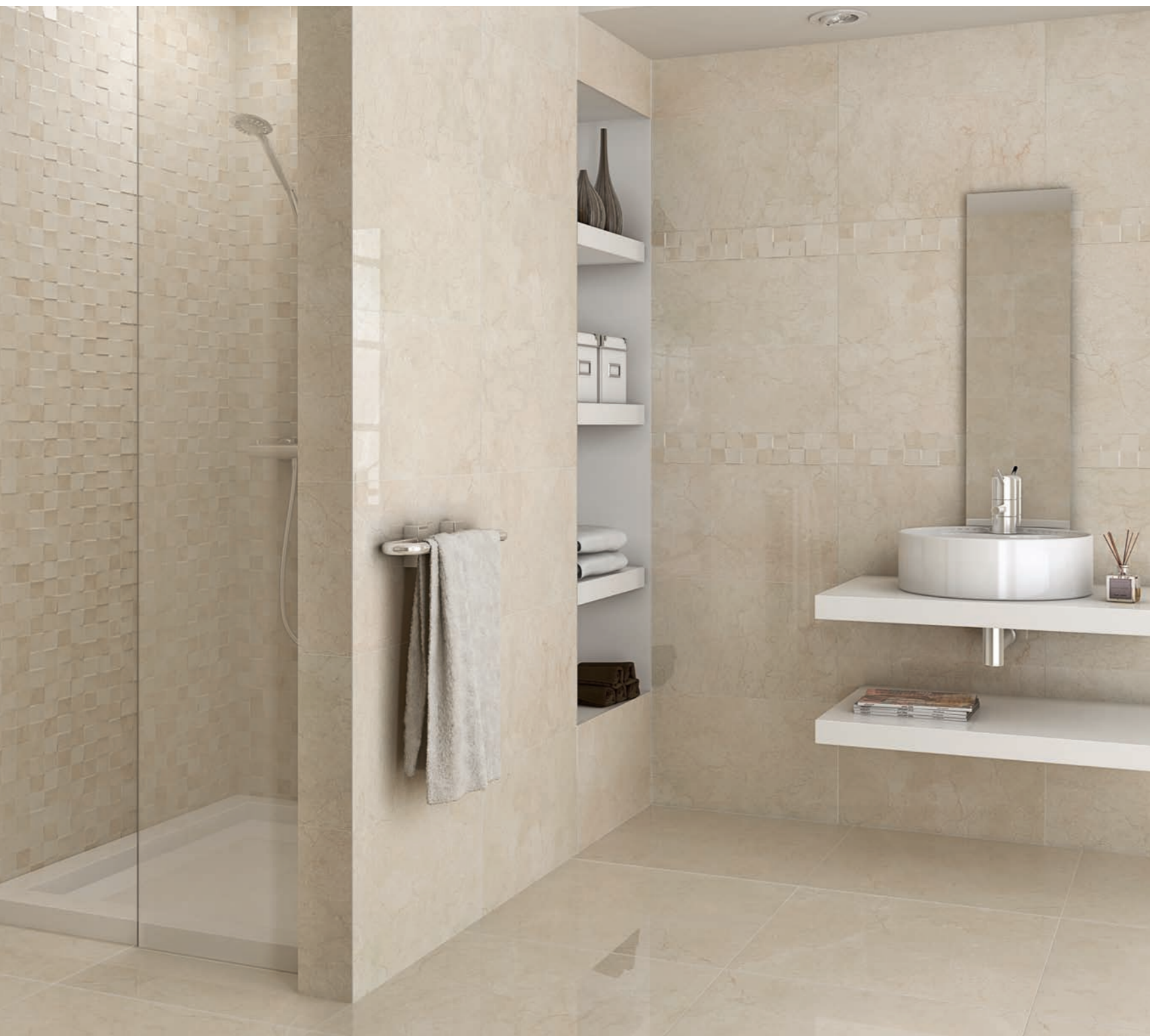
Rvto. / Wall / Rvrm.: At. Luxor Marfil 33,3x55 - At. Rlv. Luxor 33,3x55 Pvto. / Floor / Sol: At. Luxor Marfil 60,8x60,8