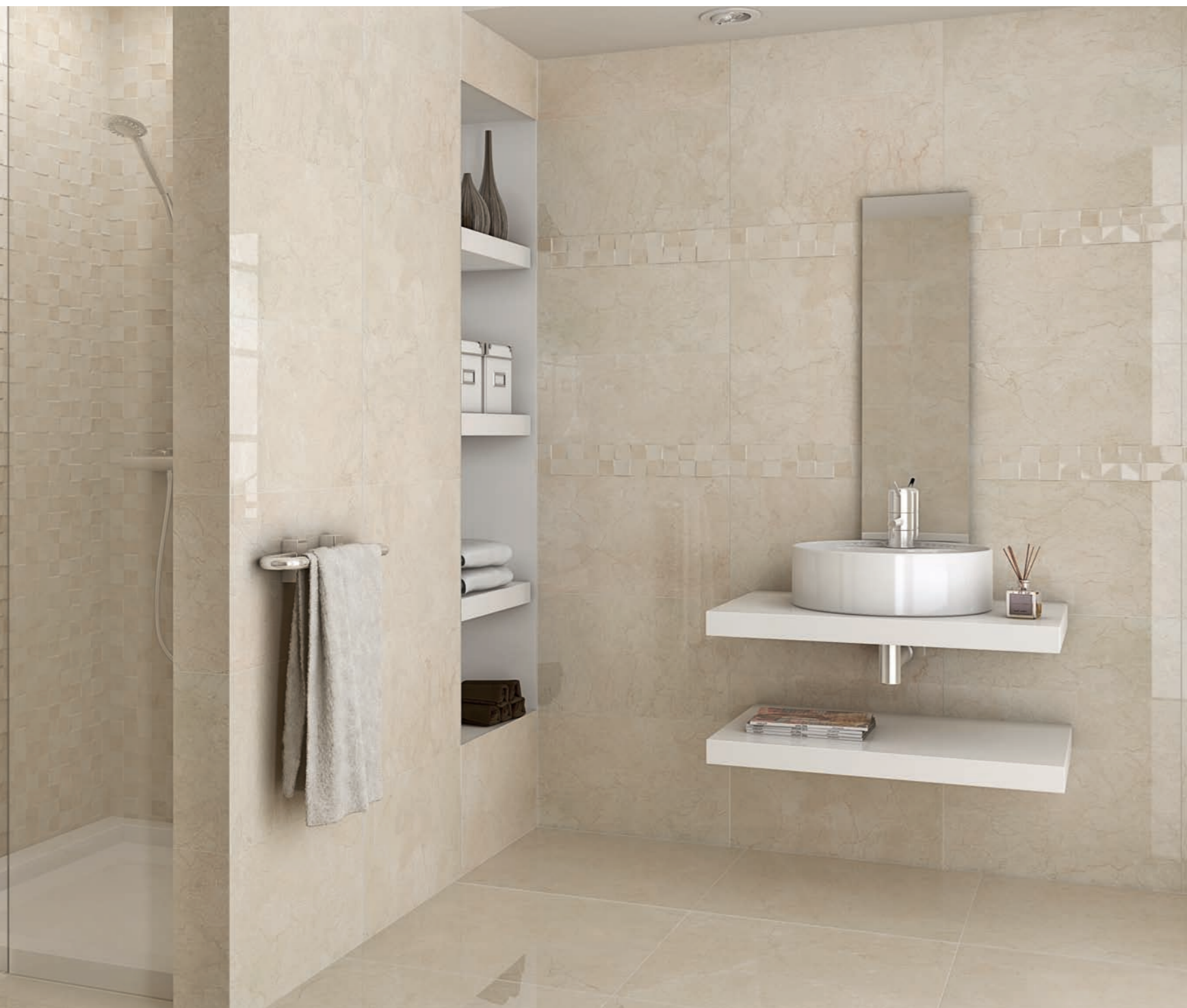
Rvto. / Wall / Rvtn.: At. Luxor Marfil 33,3x55 - At. Rlv. Luxor 33,3x55 Pvto. / Floor / Sol: At. Luxor Marfil 60,8x60,8