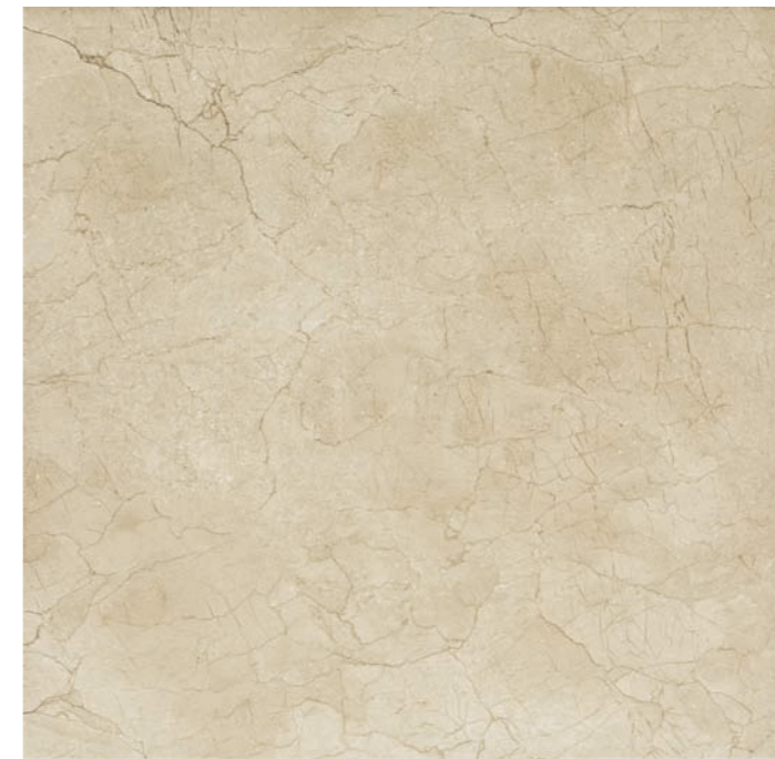
●At.Luxor Marfil 60,8x60,8 M10 15.440.33.4084 PEI 4

GRES PORCELÁNICO ESMALTADO GLAZED PORCELAIN TILES GRÈS CÉRAMÉ ÉMAILLÉ