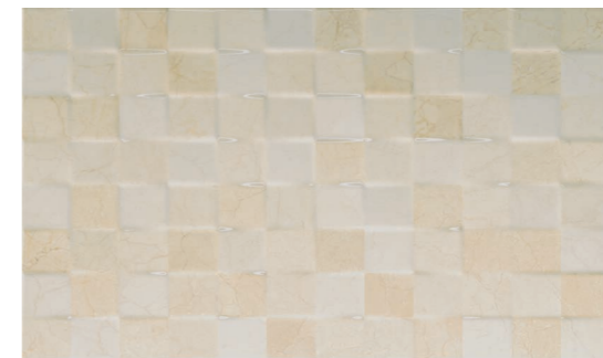
●At.Rlv.Luxor 33,3x55 M08 2.870.14082 ©