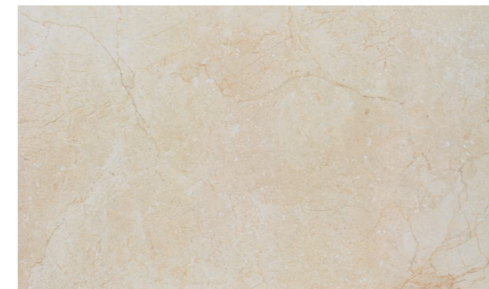
●At.Luxor Marfil 33,3x55 M07 2.870.33.4084 ©