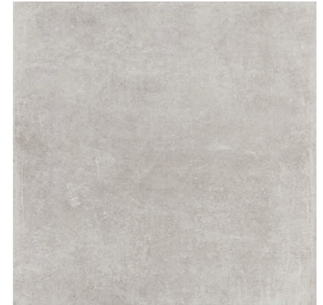
●At. Entis Ceniza 60,8x60,8 M08 15.460.019.0781 PEI 4 ●