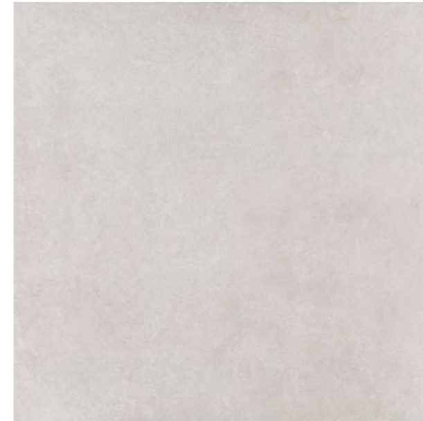
●At. Entis Arena 60,8x60,8 M08 15.460.017.0781 PEI 4 ●

GRES PORCELÁNICO ESMALTADO GLAZED PORCELAIN TILES GRÈS CÉRAME ÉMAILLÉ