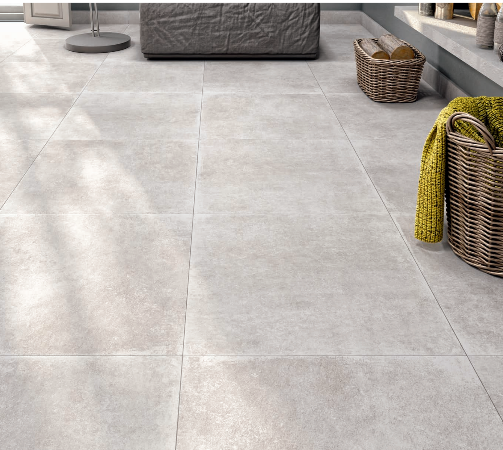
Pvto. / Floor / Sol: At. Entis Arena 60,8x60,8