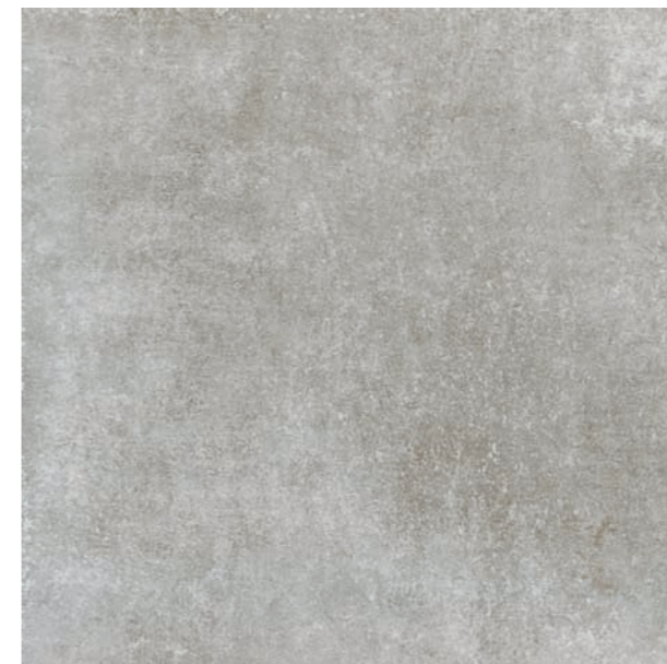
●At. Entis Gris 60,8x60,8 M08 15.460.002.0781 PEI 4 ●