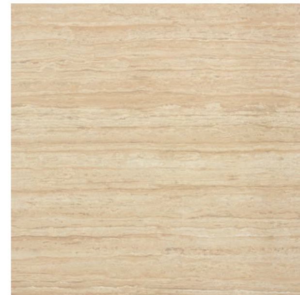
●At.Traven Crema 60,8x60,8 M08 15.460.096.0783 PEI 4