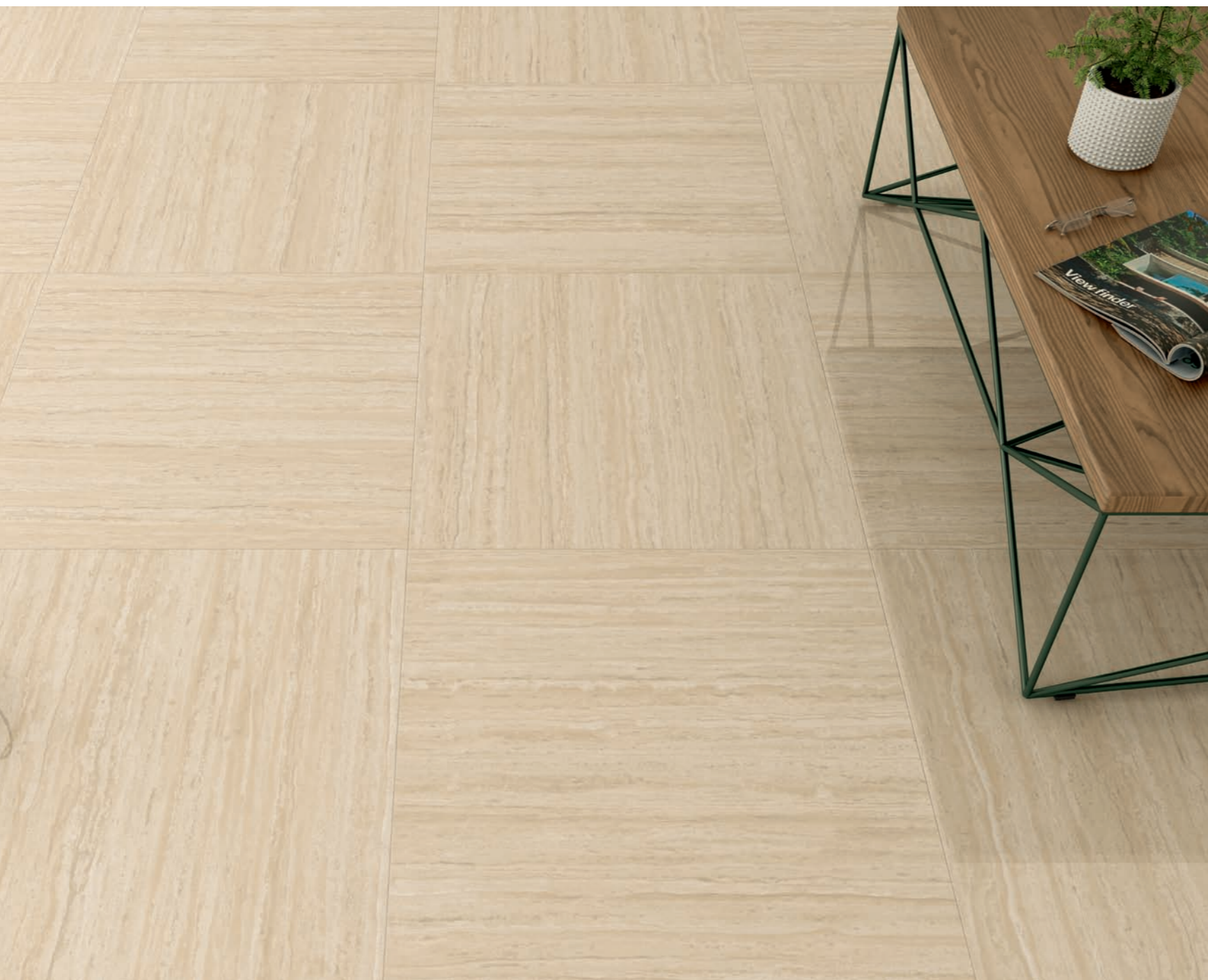
Pvto. / Floor / Sol: At. Traven Crema 60,8x60,8