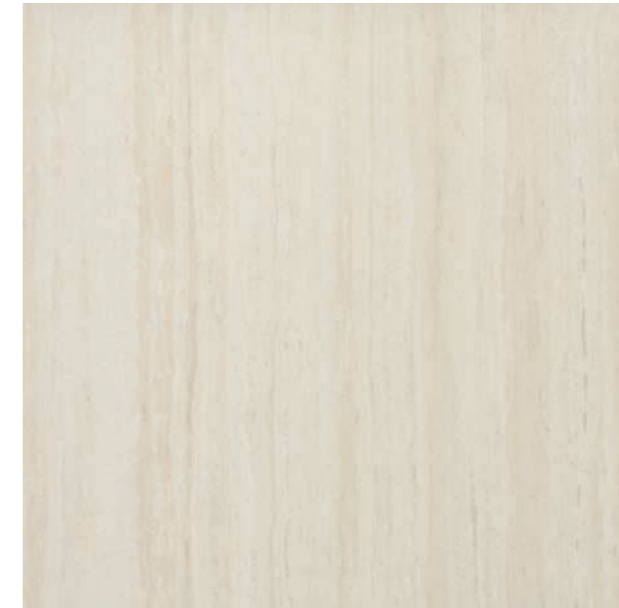
●At.Traven Nácar 60,8x60,8 M08 15.460.030.0783 PEI 4

GRES PORCELÁNICO ESMALTADO GLAZED PORCELAIN TILES GRÈS CÉRAMÉ ÉMAILLÉ