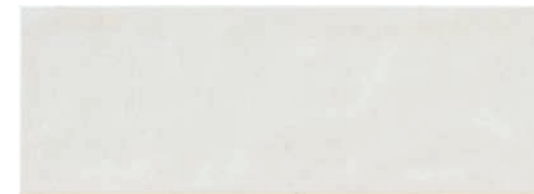
●At.Lamar Blanco 25x70 M08 02.185.012.9623 ●