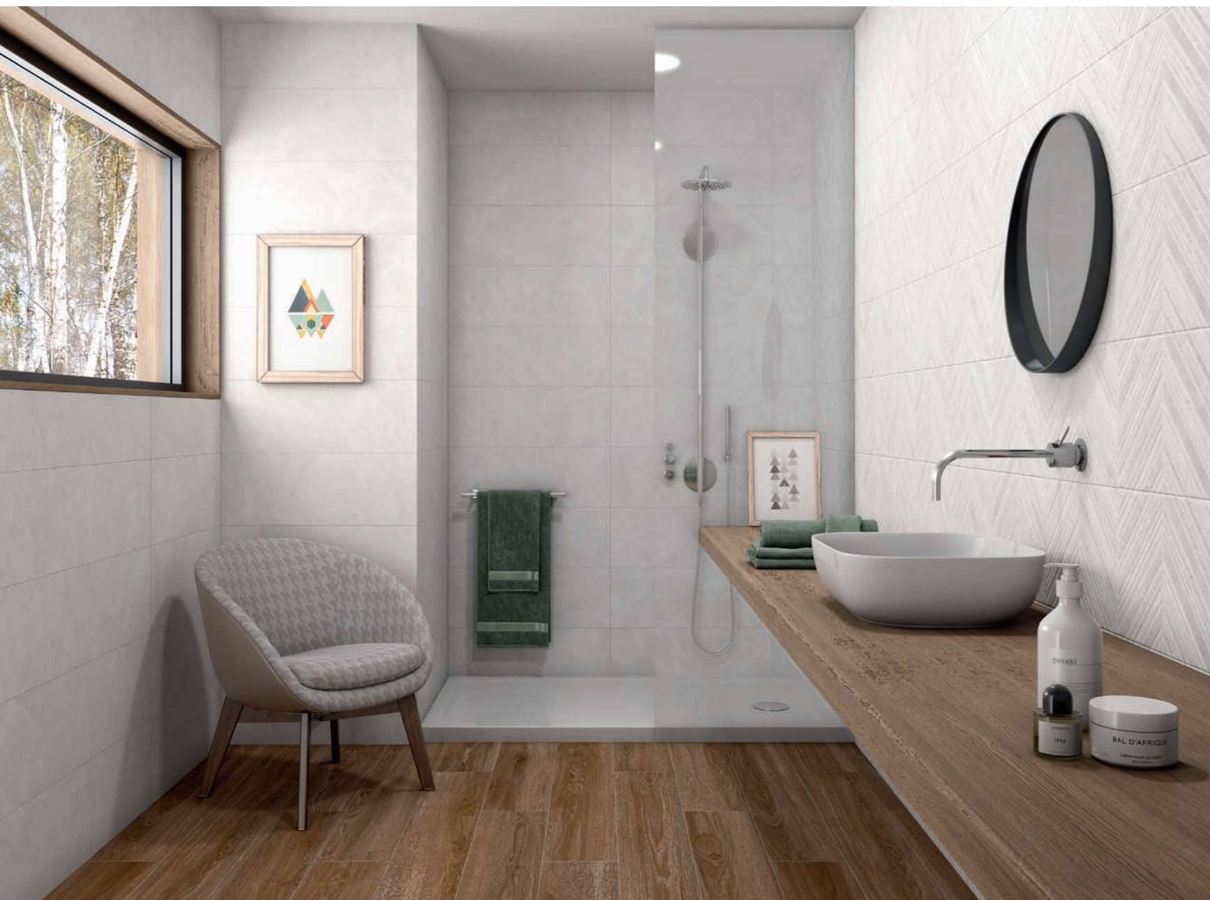
Rvto. / Wall / Rvtm.: At. Lamar Blanco 25x70 - At. Rlv. Lamar Blanco 25x70 Pvto. / Floor / Sol: At. Aren Terra 20x120