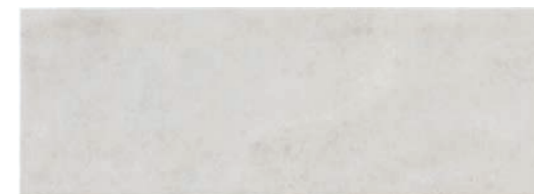
●At.Lamar Ceniza 25x70 M08 02.185.019.9623 ●