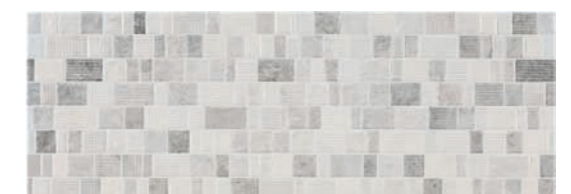
●At.Dec.Lamar Mix 25x70 M08 02.185.100.9625 ●