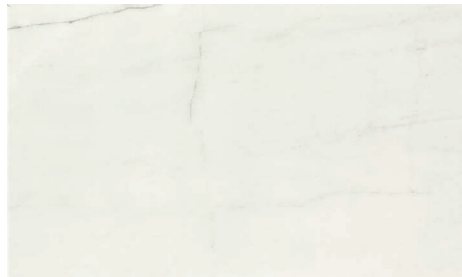
● At. Chipre Blanco 33,3x55 M04 002.870.0012.04069