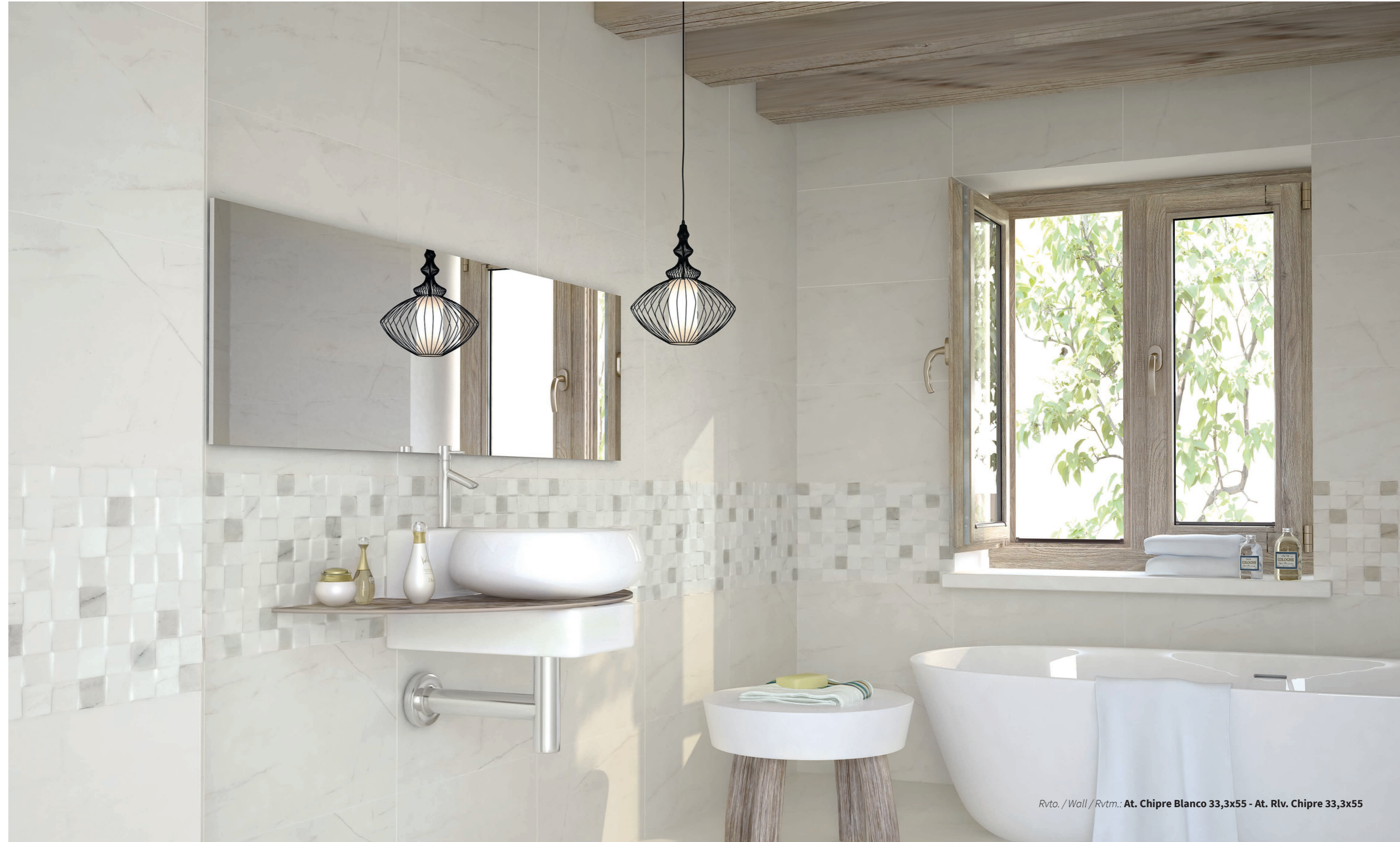
Rvto. / Wall / Rvtrm.: At. Chipre Blanco 33,3x55 - At. Rlv. Chipre 33,3x55