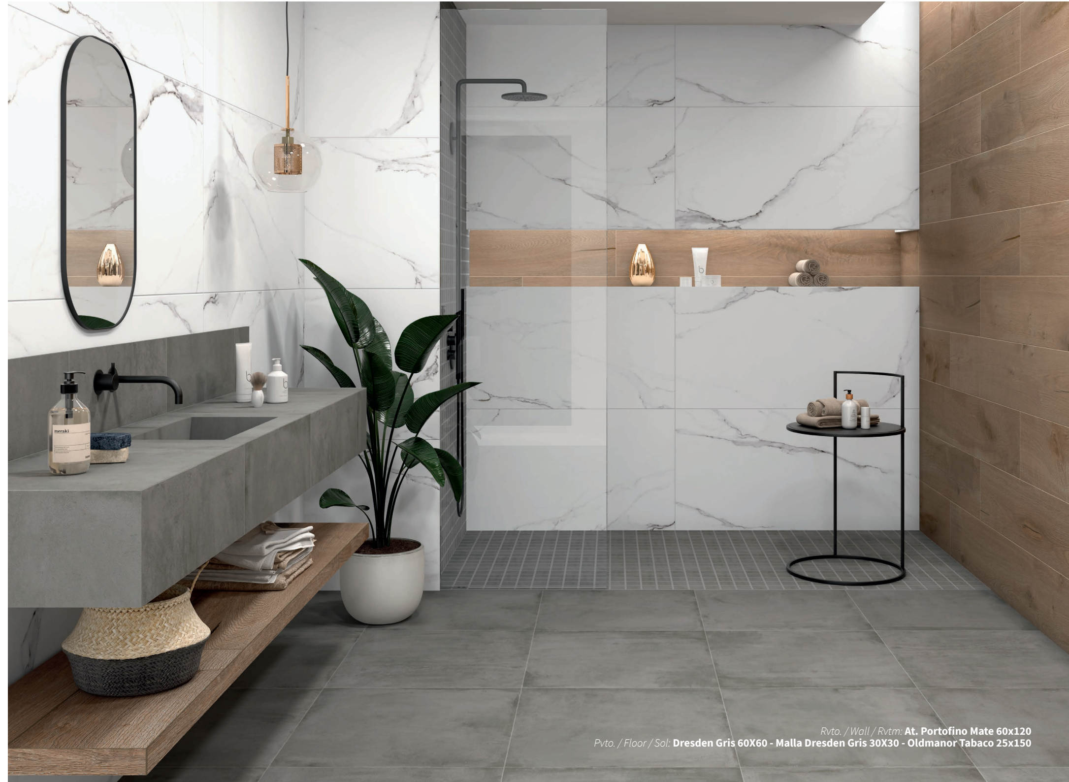
Pvto. / Floor / Sol: Dresden Gris 60X60 - Malla Dresden Gris 30X30 - Oldmanor Tabaco 25x150 Rvto. / Wall / Rvtm: At. Portofino Mate 60x120